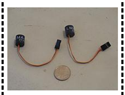
These are the alarms used in the flight tests, shown here next to a quarter which I'd borrowed from a club member. They're small enough to be used in all but the smallest models with virtually zero weight penalty. No worries about the quarter...I gave it right back.

The club has a simply beautiful 600' (183m) paved runway at exactly sea level down the center line. It's surrounded on three sides by mostly open desert dotted by a lot of sage and creosote bushes. Many a model has gone down in that desert and proven hard to find later. While relatively uncommon, an encounter with a rattlesnake is a possibility.