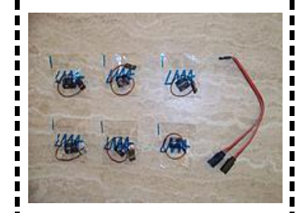
The complete contents of the package I received from Nik, including the Y-harness