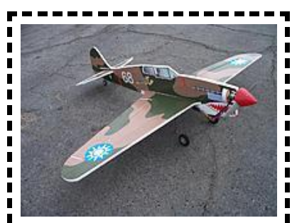
Beauty shot of the P-40 prior to its maiden flight. I'm pleased to say it still looks pretty much the

In any case, the receiver was easily accessible and even though the ailerons were mixed on two different channels, channel number five for retractable landing gear was unassigned. Perfect.